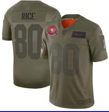
Jerry Rice San Francisco 49ers Nike Retired Limited Jersey