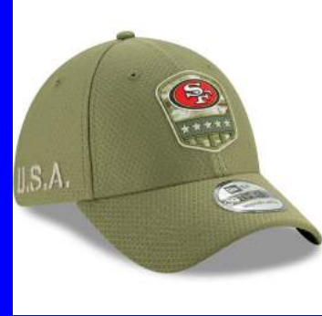
New Era Sideline 39THIRTY Flex Hat