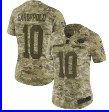
Jimmy Garoppolo San Francisco 49ers Nike Women's Jersey